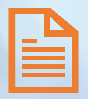
Access to pool of over 350 young female engineers